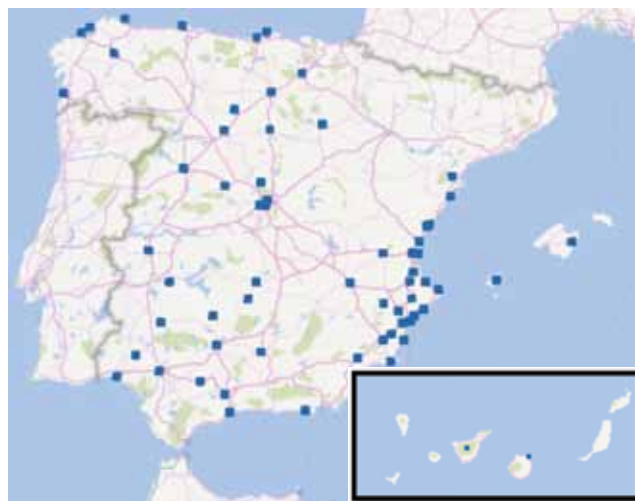
FIGURE 1. Distribution of the participating health departments (laboratories).

Of the 141 requested laboratories, 76 laboratories, on a voluntary basis, participated in the study, corresponding to a catchment area of 17,679,195 inhabitants (38% of the Spanish population) from 13 different communities throughout Spain. Figure 1 shows the distribution of the different health departments around the country in a map. All laboratories served Primary Health Care Units and also hospital wards. Moreover, every laboratory included in the study performs all of the preselected tests. Table 1 shows the descriptive analysis of every test rate per 1000 inhabitants. CQD was up to ten times higher in the less requested tests when